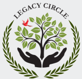
Fairfax County Park Foundation

Adapted and Equity Outreach programs enrich the lives of many neighbors including Healthy Strides, 4-H Fair & Carnival, Earth Day Fairfax, First Hike Fairfax, Lunar New Year and FCPA Camps and Classes.